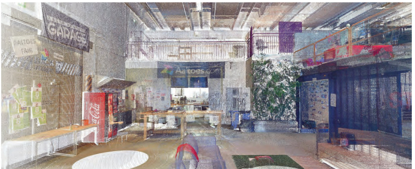
▲ Figure 1, A point cloud of Aalto University's Startup Sauna.

Points are obtained from range measurements by the laser. The laser scanner emits a beam that is reflected with a revolving mirror to obtain a two-dimensional (2D) profile from the surroundings. If this 2D scanner is then simultaneously rotated on top of a tripod, it performs a 3D scan of the environment. Currently a single terrestrial laser scanning (TLS) scan is the most precise way of acquiring a dense point cloud of the surrounding environment. Due to occlusions, however, several scanning locations are needed – even in a relatively simple space – to achieve full coverage. It is possible to