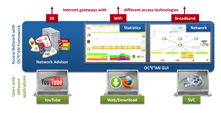
Fig. 3. Setup and components of OC<sup>2</sup>E<sup>2</sup>AN

OC^2E^2AN monitors the network and the QoE of the users as specified in Table I. It performs resource management actions such as dynamic traffic prioritization for certain critical flows. If necessary, it additionally changes the services' quality depending on the current network situation.