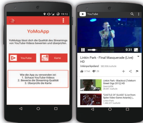
Fig. 1. Screenshot of the YoMoApp.

The remainder of this paper is structured as follows. First, we briefly introduce the YoMoApp in the Section II. After-