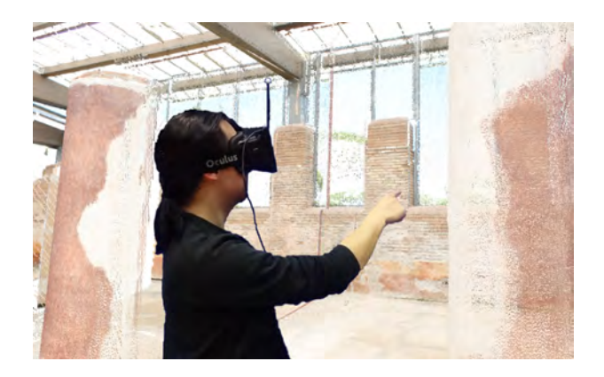
Figure 1: Illustration of a user exploring an immersive PCVE of the cultural heritage site of Ostia Antica, Italy.

*e-mail: gerd.bruder@uni-wuerzburg.de †e-mail: frank.seinicke@uni-wuerzburg.de ‡e-mail: nuechter@informatik.uni-wuerzburg.de